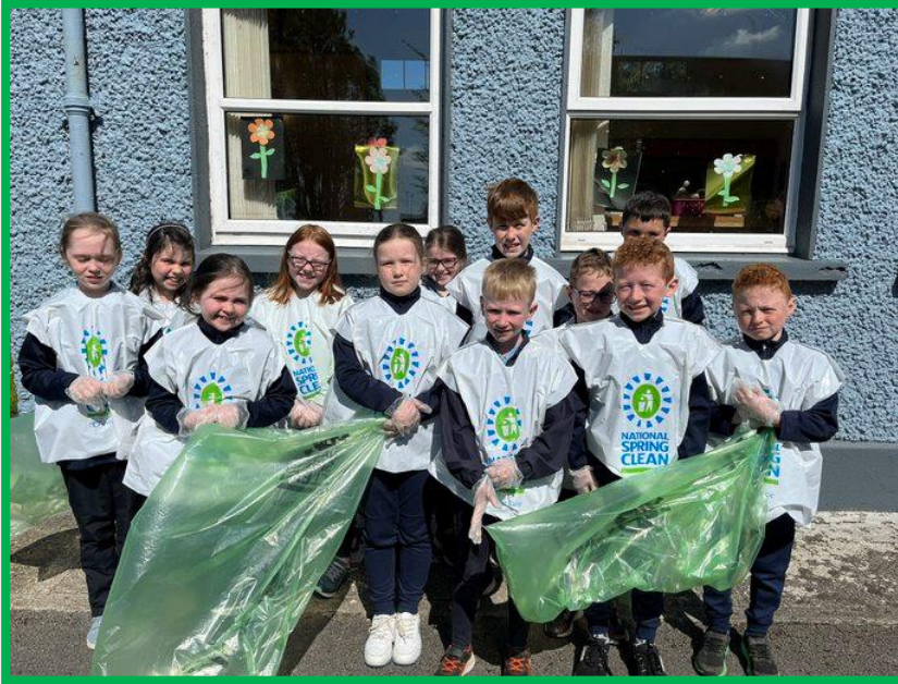
National Spring Clean