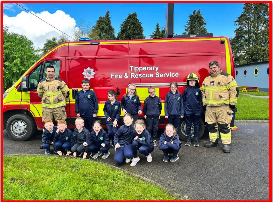
Junior Infants, Senior Infants & First Class