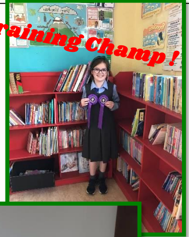
Dog Training Champ!