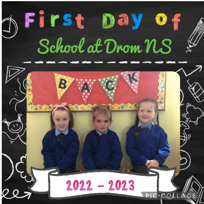
Drom National School Junior Infants 2022 – 2023