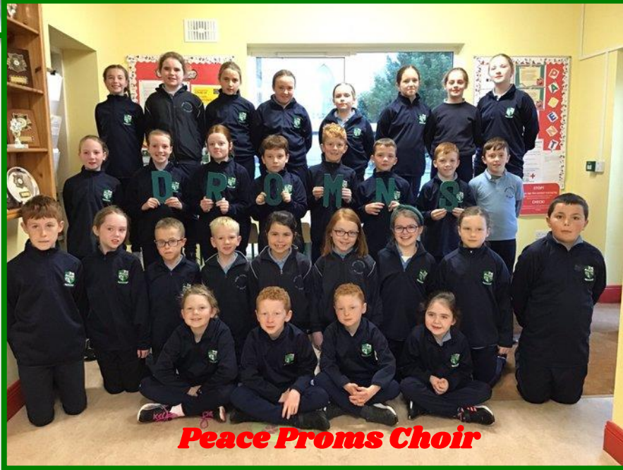
Peace Proms Choir