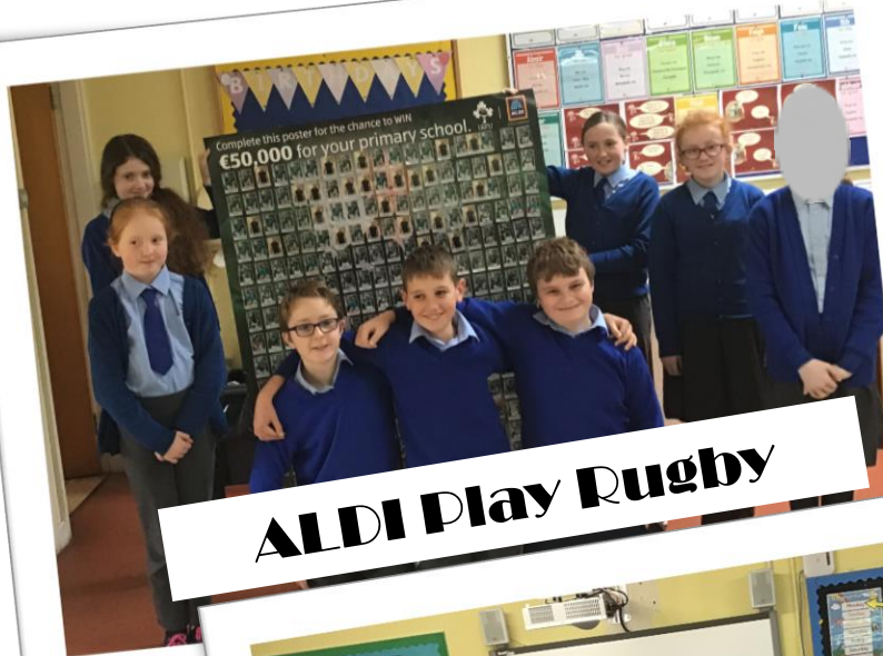
ALDI Play Rugby