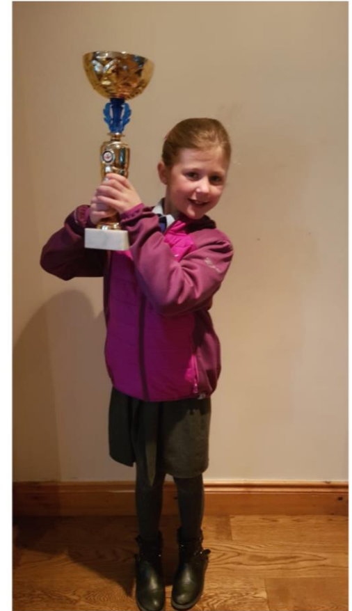
Drom's Dancing Dynamo!