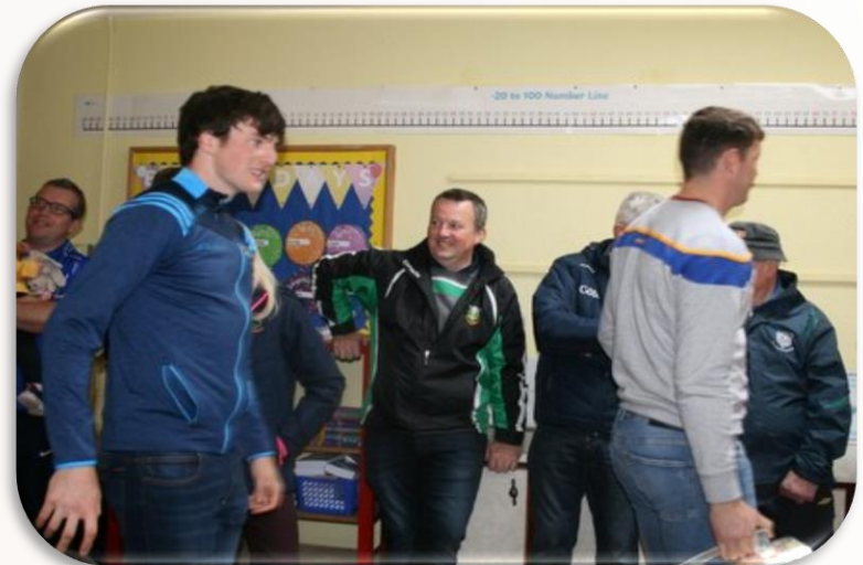
Tipperary Senior & U20 Hurling Champions visit Drom National School