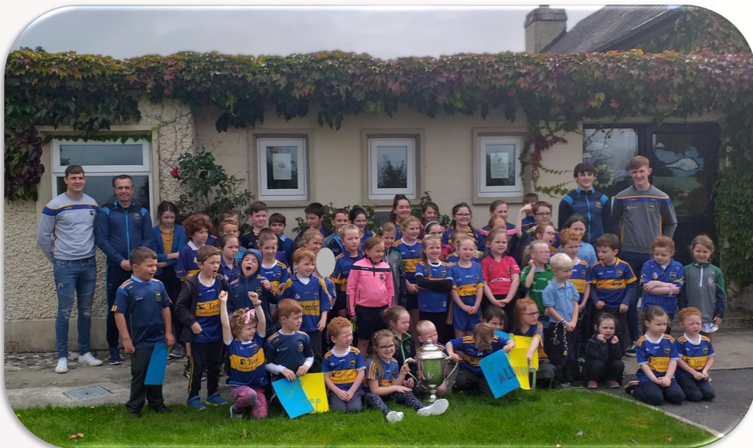
Tipperary Senior & U20 Hurling Champions visit Drom National School