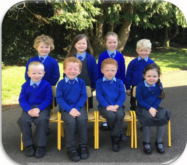
Drom National School Junior Infants 2019 - 2020