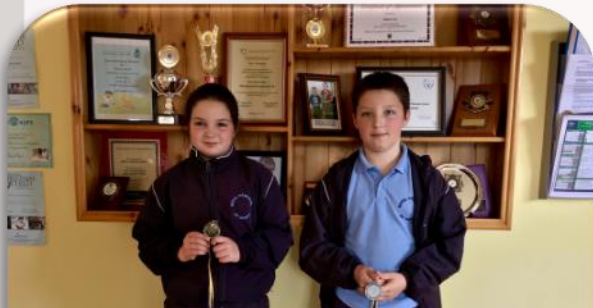
Brilliant Badminton Buddies