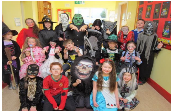
Halloween Costumes – 2 nd , 3 rd & 4 th