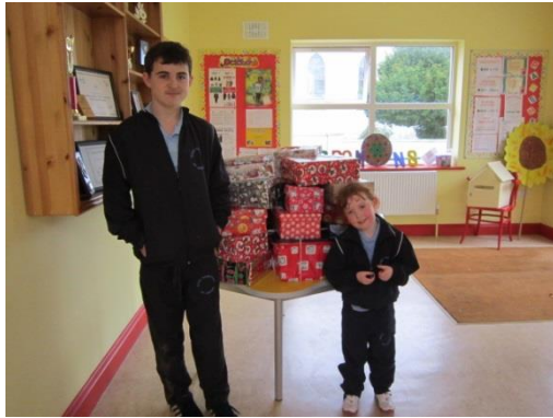
Team Hope Shoebox Appeal