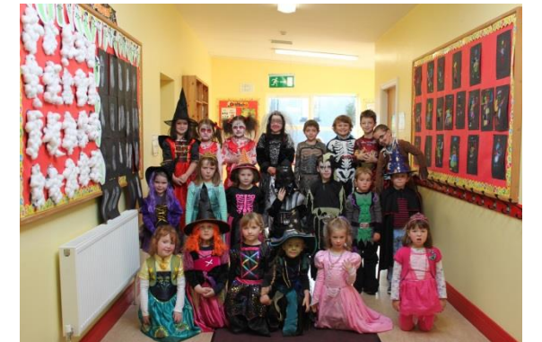
Halloween Costumes – Junior Infants, Senior Infants, First Class