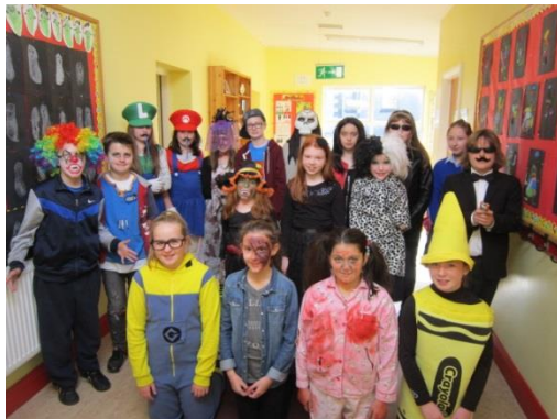
Halloween Costumes – 5 th & 6 th