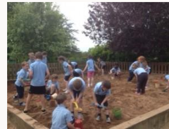
YEATS COMPETITION SUCCESS