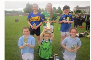
THE GREAT DROM BAKE OFF!